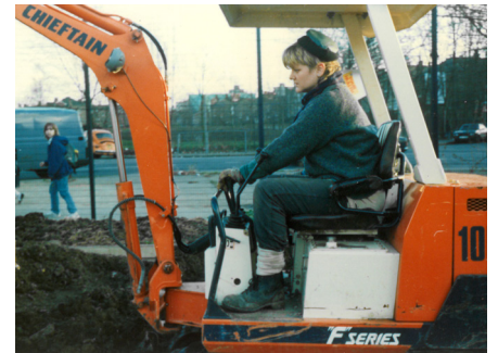
Walworth Garden Construction.