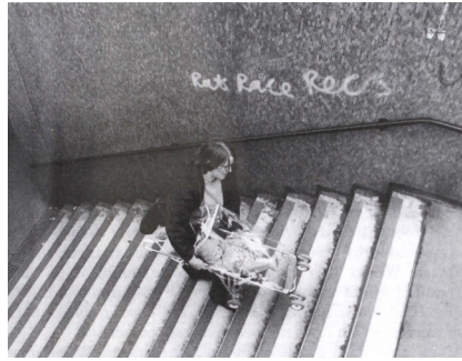
Making Space, Urban Obstacle Courses.