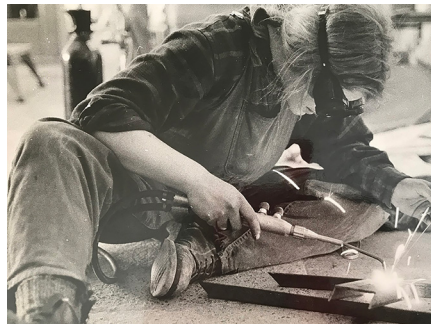
Lambeth Women's workshop.