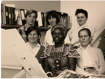
Members of Matrix in the 1990s.