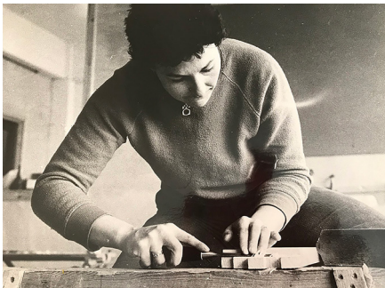
Lambeth Women's workshop.