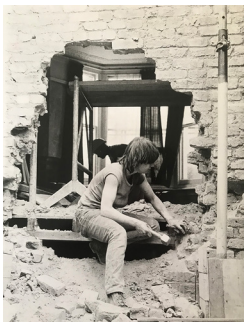
Women's Building CO-op.