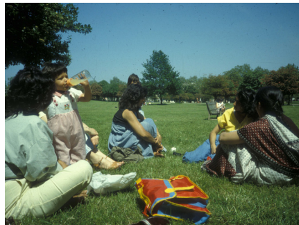
Brick picnic.