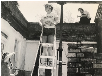
Women's Building CO-op.