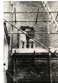
Women's Building CO-op.